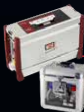
Unit and gas washer